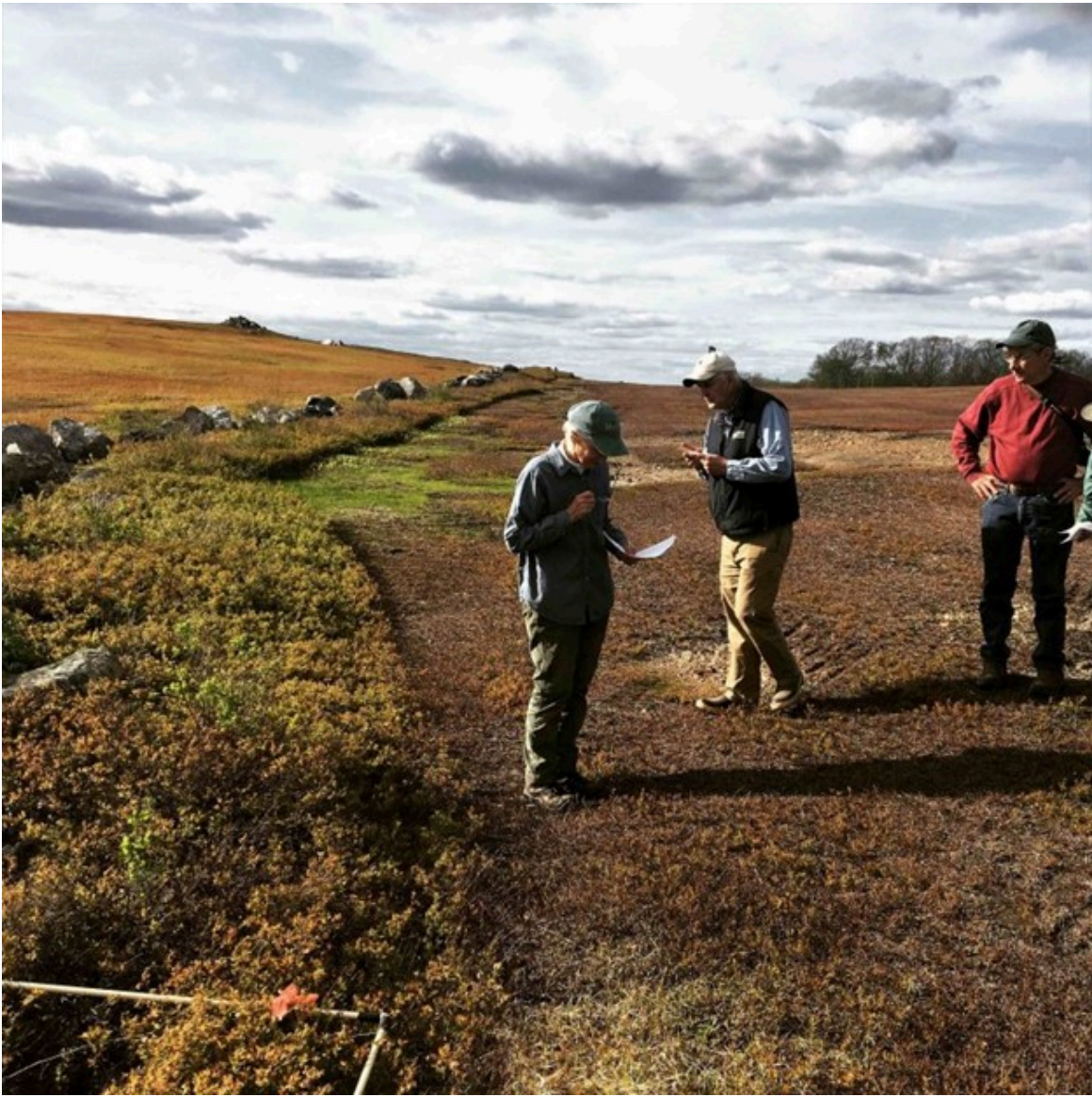
Labor of love, Maine wild blueberry growers